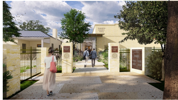
Dawson Family Hall (2023)