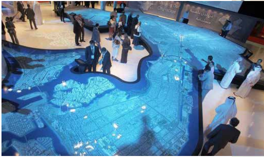
Earth Science Center (2025)