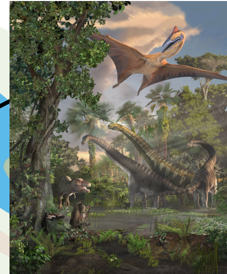
Time of the Giants Dinosaur Gallery (2027)